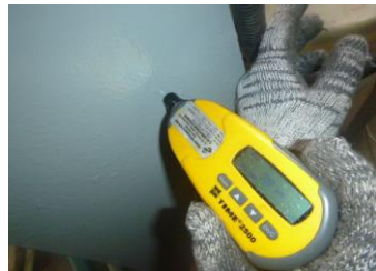
Dry Film Test Results